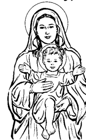
MARY, MOTHER OF GOD

JANUARY 1, 2010 FEAST OF MARY, MOTHER OF GOD OCTAVE DAY OF CHRISTMAS CIVIL NEW YEAR'S DAY HOLY DAY OF OBLIGATION (Masses as for a Sunday)