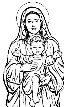
MARY, MOTHER of GOD