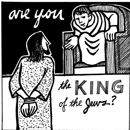
SO THEN, YOU ARE A KING? (Words of Pontius Pilate to Jesus)

By word association we are reminded of other things when we hear a certain word, for example, bread-butter, salt-pepper, etc.